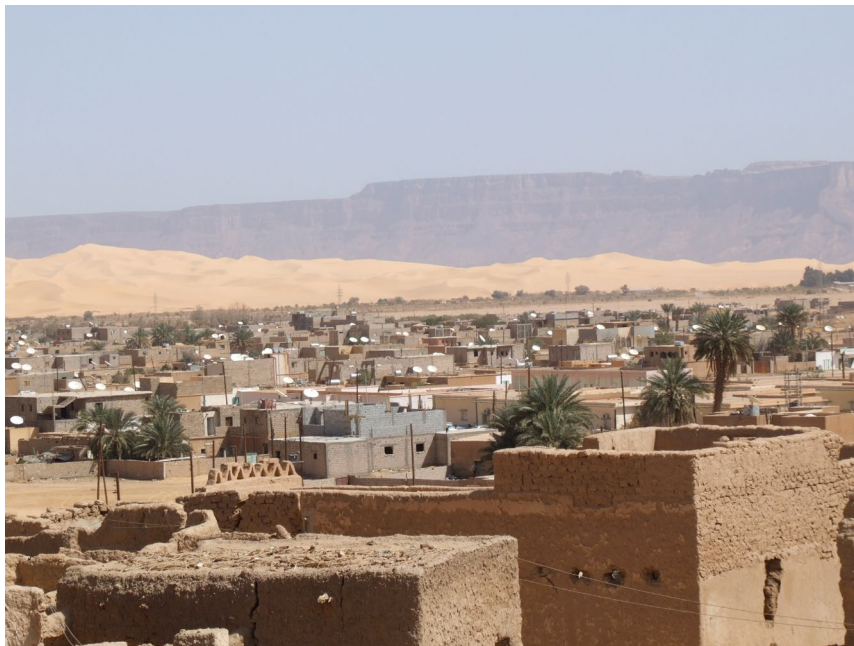
Panorama of Ghat town.

Note sand sea and mountain scarp in background, which impedes vehicular 'escape'.