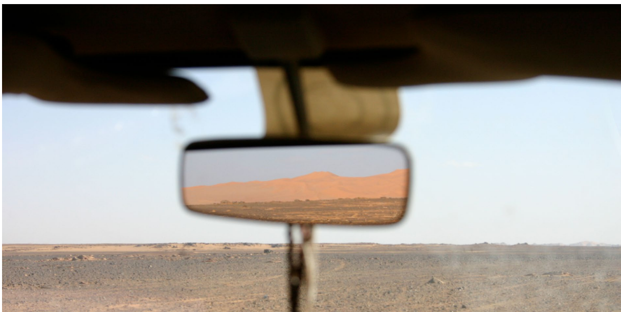
Desert just outside Al-Awaynat.

The Niger government, which does not have the blessing of the country's entire population on this issue, sees the Agades base as a necessity to address the growing menace of terrorism that poses a threat to the security of Niger and the region.