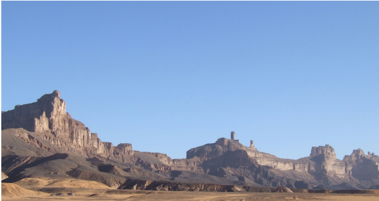
The mountain of In Itinen guards the entrance to Ghat from the north.

Moreover, once identified, any vehicles trying to make the journey from the Ghat region to Niger could have been monitored and/or attacked by U.S. drones operating out of Niamey or Dirkou in Niger, or by manned aircraft based at the 'lily-pad' airbase at Al Wigh close to the Niger border, some 100 km SSE of Al Katrun.