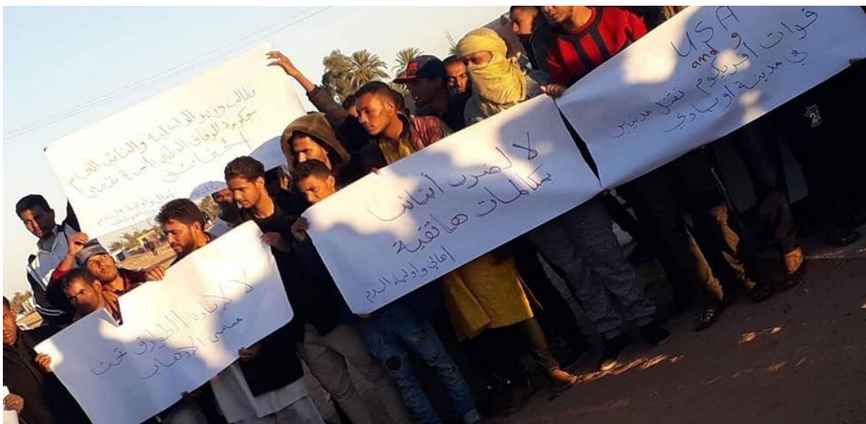
Tuareg community protest

Later that day, the 29 November, members of the Tuareg community in Ubari, gathered to condemn the U.S. airstrike. 4 They protested that the 11 people killed were not al-Qaeda militants, as AFRICOM claimed, but innocent Tuareg civilians and off-duty soldiers who had been killed under the pretext of terrorism without any evidence to substantiate their guilt. Banners, written in Arabic, accused AFRICOM of killing innocent civilians. 5