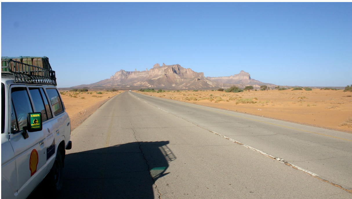
The road heading north out of Ghat to Al-Awaynat.