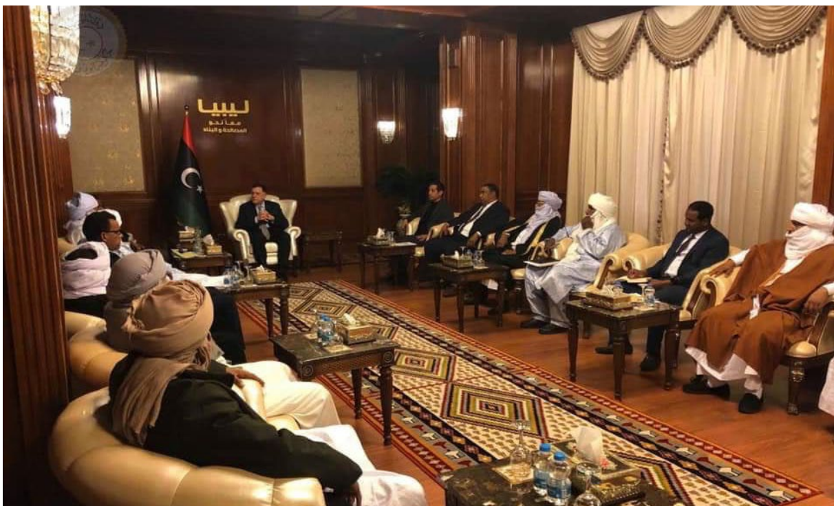
Meeting between the Tuareg Council and the GNA.