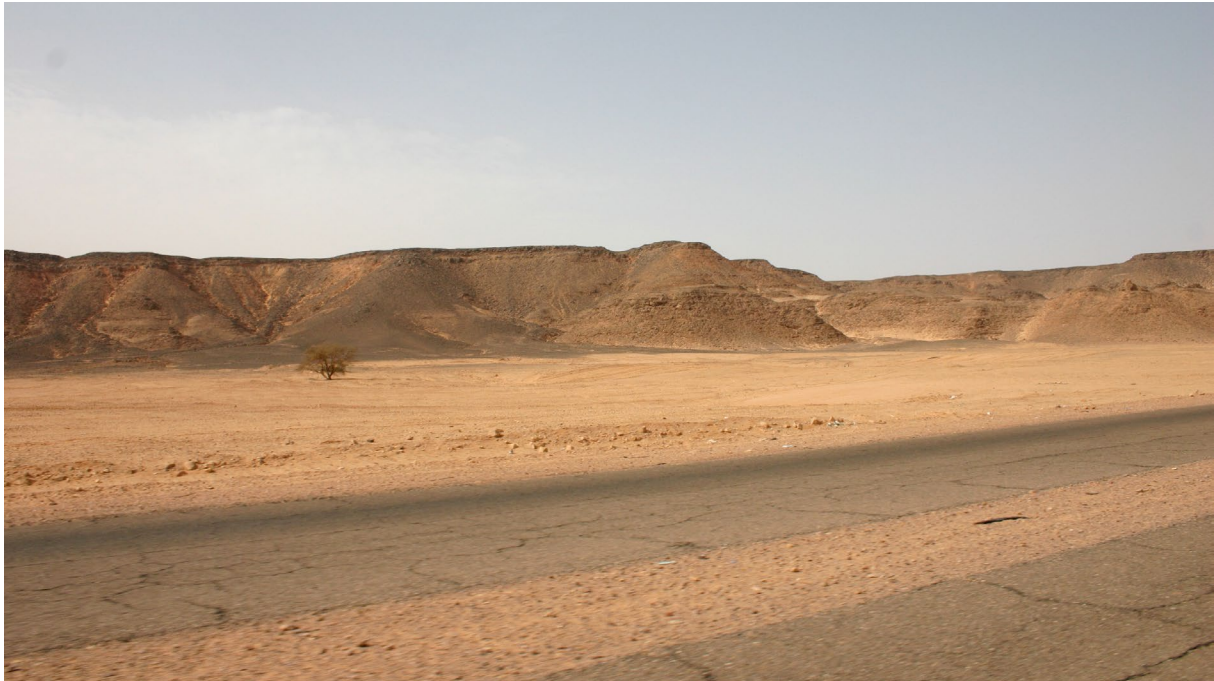
The main road between Ubari and Al-Awaynat. Messak Settafet in background to the south of the road.

The group of Ghat Tuareg who were taking the excavator across the Algerian border were working for the Tahala owner. They claimed to have had an agreed sale for the excavator in Illizi. That does not seem to be in doubt. Indeed, the end of story, at least as far as the excavator is concerned, is that it did finally arrive in Illizi where it was sold.