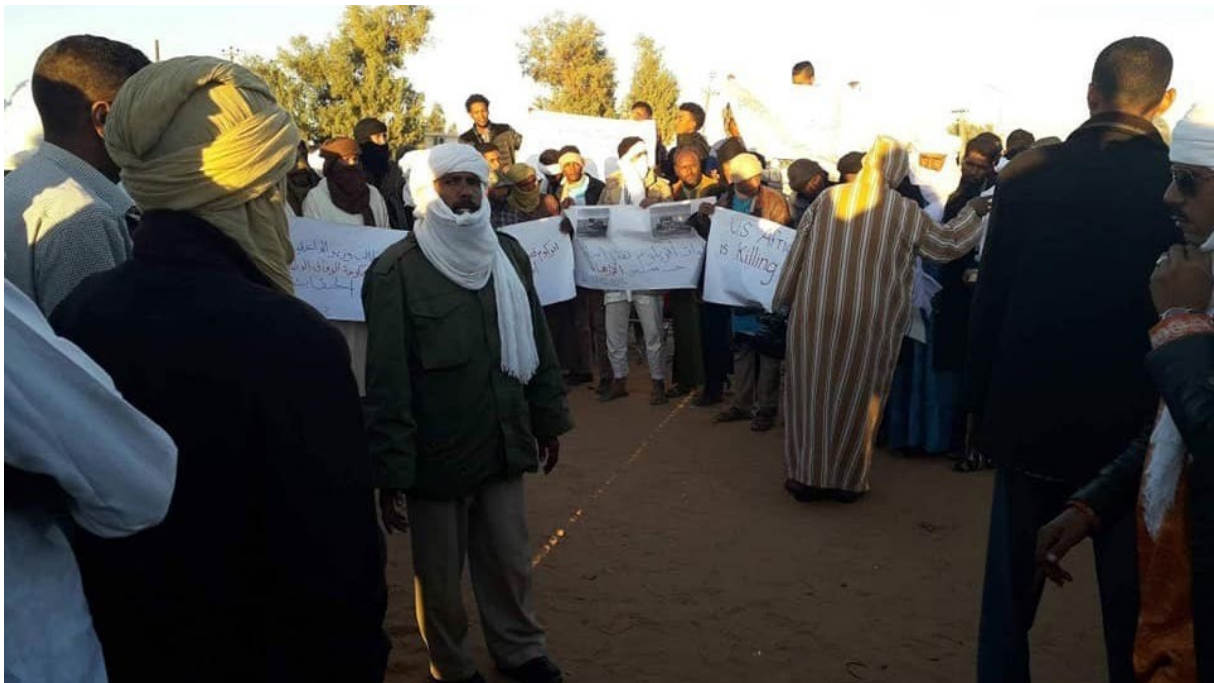
Tuareg community protest

It might seem from the AFRICOM statement and the media reports summarised above that one of two things happened at Al-Awaynat. Either, the American airstrike hit a wrongly identified target and innocent Tuareg civilians and off-duty soldiers were killed, or the target was correctly identified as AQIM militants, as AFRICOM claims, and local people organised immediate, large-scale protests in an attempt to cast aspersions on the American claim.