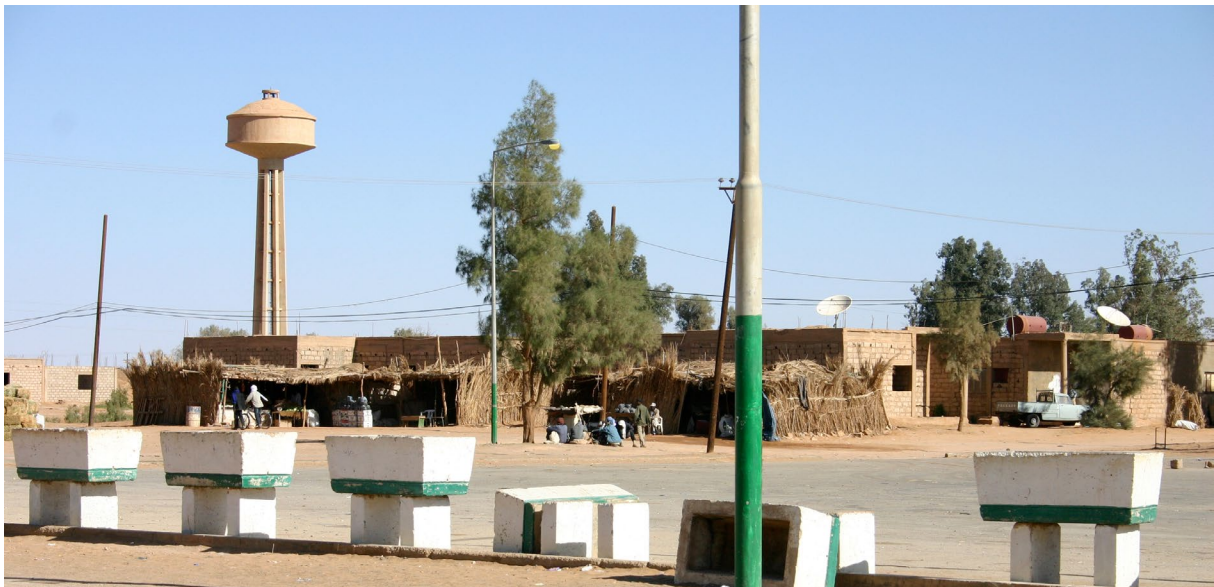
Driving through Al-Awaynat

The airstrike took place near Al-Awaynat (Al-Uwaynat) 3 , a small town on the main tarmac road that connects Ubari, a key town in Libya's south-western Fezzan region, and the ancient caravan-trading town of Ghat, close to the Algerian border in the extreme southwest corner of Libya. Al-Awaynat is 262 km west-south-west of Ubari, 100 km north of Ghat and approximately 80 km from the Algerian border.