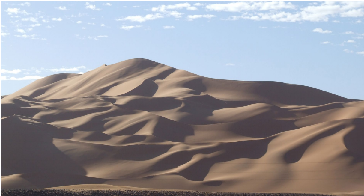
Ubari sand sea, just to the north of Ubari town.

If a proper investigation had been carried out, all these questions would have been answered. However, it appears that it was in neither the GNA’s nor AFRICOM’s interest for such an investigation to be undertaken. If such an investigation had been undertaken, it would almost certainly have confirmed that no attempt was made to verify the veracity of what was little more than third-hand ‘hearsay’, possibly even a ‘hoax’, passed up from a remote security station in the depths of the Sahara.