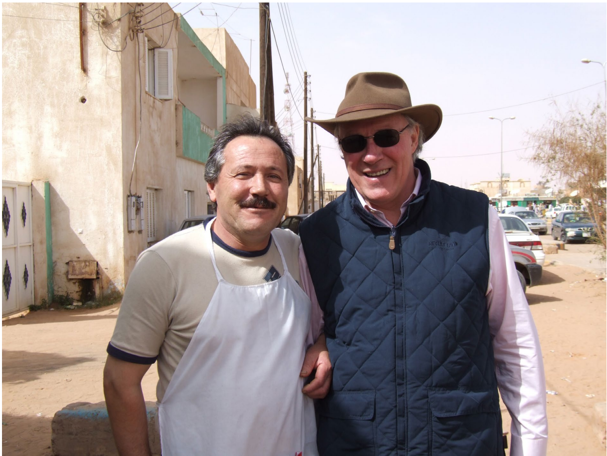
Author with a local street restaurateur on Ubari high street 2016. The road in the background goes to Uwaynat and Ghat.