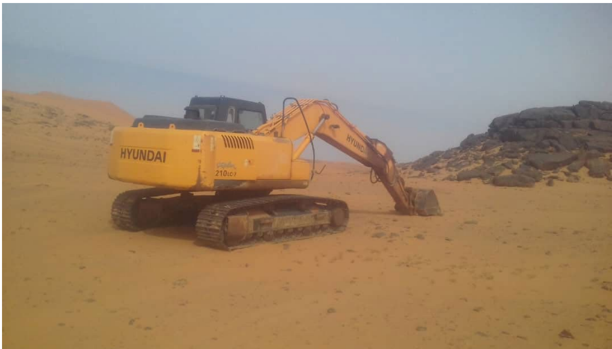
Excavator at Tanout Mallt

Research by the author over the three months following the airstrike has pieced together a narrative, which starts with what local people have called a ‘bulldozer’, but which was technically a Hyundai 210 LC-7 crawler-excavator weighing 21.7 tons. 13