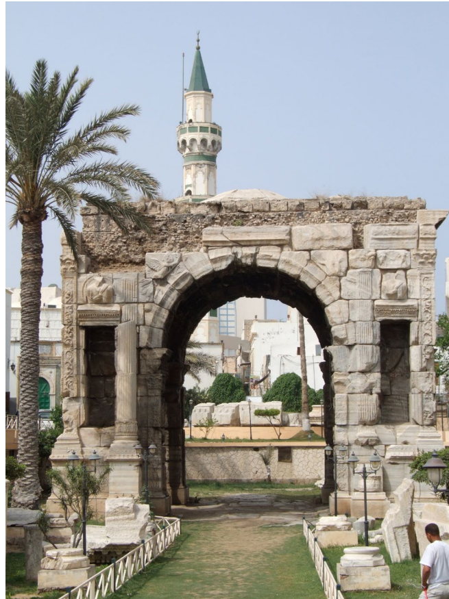
Tripoli - Roman Arch